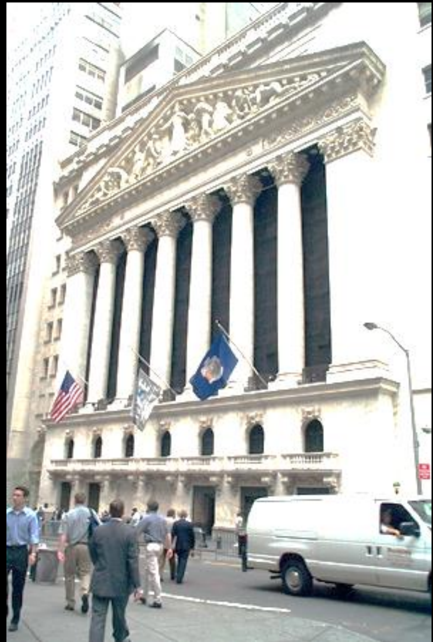
New York Stock Exchange