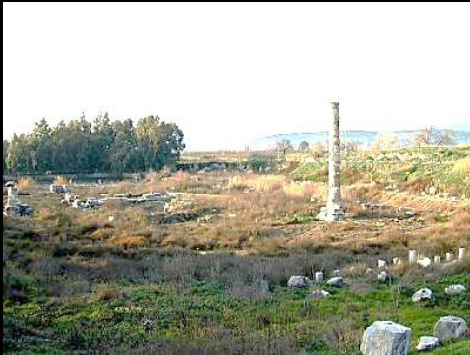
Temple of Artemis