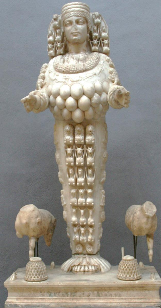
EPHES ARTEMIS M.S. 125-178 ARTEMIS EPHESIA 125-175 B.C. EPHESIAN ARTEMIS 125-175 A.D. 12-718